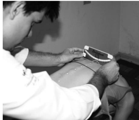
Figure 3. Measurement of scoliosis.

examination is considered as positive (figure3) (24).