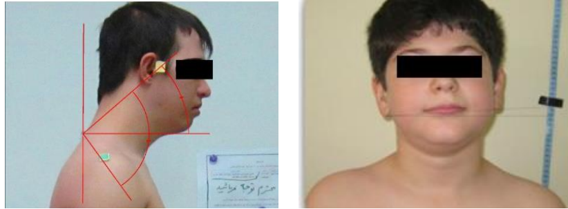
Figure 1. Measurement of forward head.

obtained. To measure the torticollis, the angle between the right and left ear lines with the horizon is determined by imaging and its angle is determined through the AutoCAD software; the normal angle of this abnormality is 46 degree (figure 1) (22).