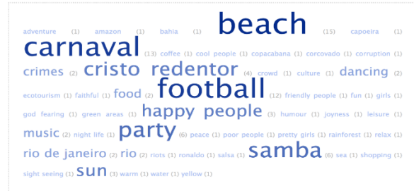
Figure 3. High Intention Group, Semantic Graph

the country started being prepared for the sports mega-events. Thus, besides news related to the mega-events, more stories about crimes, corruption, and the political situation in the country have been released. However, those aspects require more investigation opening a new research door for future study.