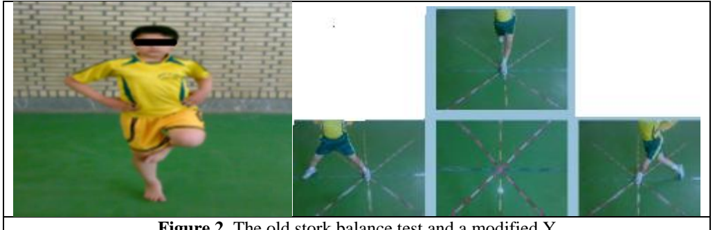
Figure 2. The old stork balance test and a modified Y

visually detects the errors ; however, in the new SDUB device these shortcomings and ambiguities have been removed and just by clicking the start button, the device automatically detects and records all errors (Figures 2 and 3).