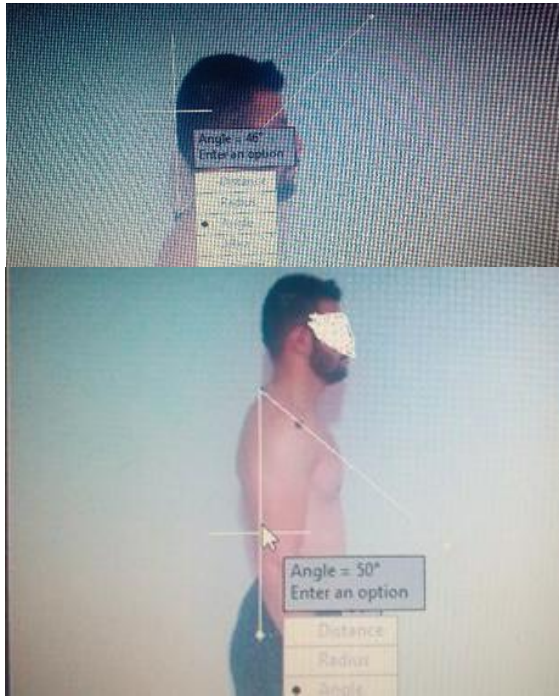
Figure 2. Forward head and forward shoulder angles measuring by photography technique.

process with vertical line (the forward head angle) were measured (22) (Figure 2).