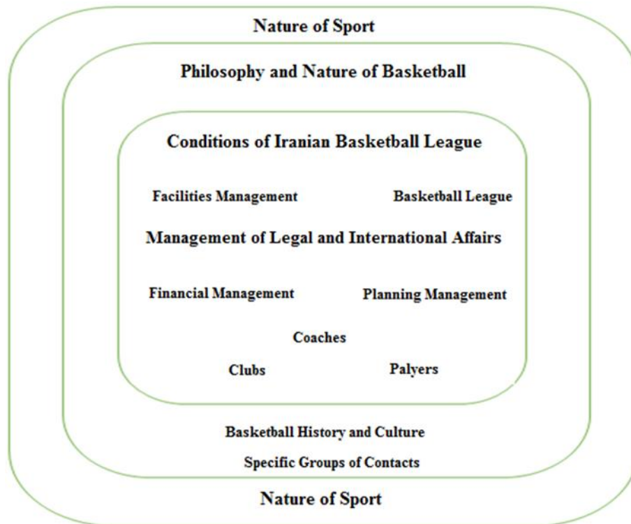
Figure 2. The Final Model of the Internal Factors and Challenges of Branding of the Iranian Basketball League

Accordingly, the Iranian Basketball League must become aware of its internal status to become a credible brand and use facilitators and control inhibitors. This stage involves understanding conditions of the league, the philosophy and nature of basketball, and the nature of sport. If the knowledge, control, and proper use of branding factors and challenges happen accurately, the Iranian Basketball League can become a credible brand. In an effort to create a satisfactory image and with continuous assessment, the Iranian Basketball League can consolidate its brand and become a mega-brand in the sports industry.