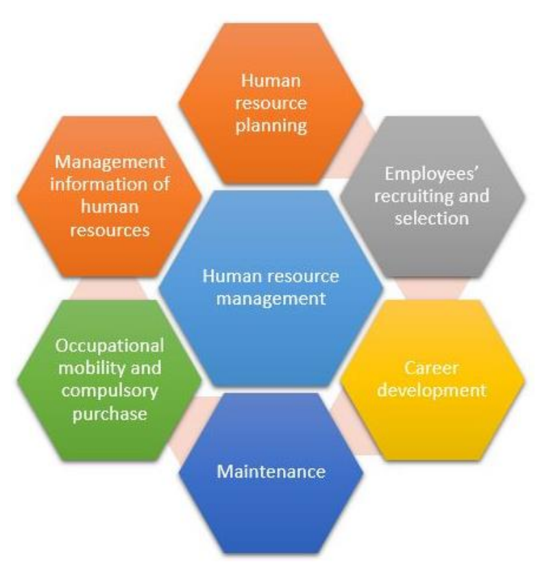
Figure 2. Pcf model (American Productivity and Quality Center, 2019)

Table 1. Systems and Processes at Iran's Ministry Of Sports and Youth