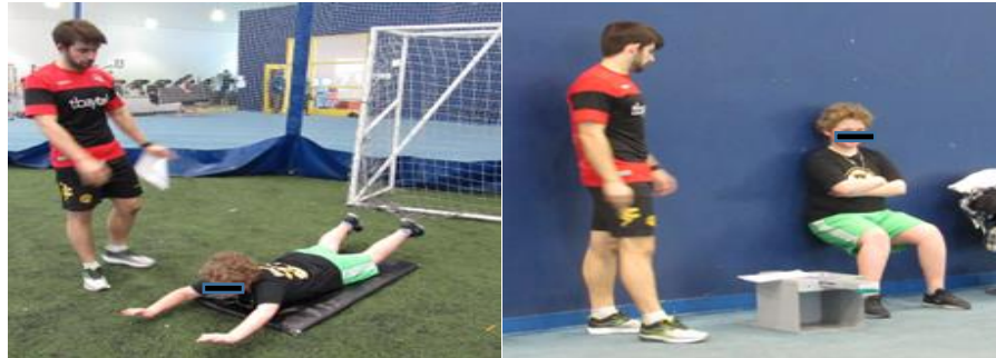
Figure 2. Illustration of the V-up (on the left) and the wall-sit tasks.

of performance. The periods between each exercise were used for demonstration and rest.