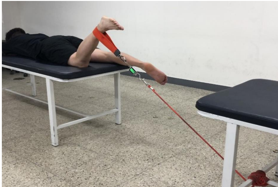
Figure 1. Maximal Voluntary Isometric Contraction of the Hamstrings in Prone Position.

Participants. Forty-six healthy young adults were enrolled. The participants had a mean age of 21.9 \pm 2.2 years, the height of 167.9 \pm 8.6 cm, and weight of 63.8 \pm 13.9 kg (Table 1). The included participants did not have any disease, injury, deformity, or history of surgery of the lower back and knee joint. Those who had pain in the relevant areas in the last six months were excluded from the study. Informed consent was obtained from all participants. This study was approved and monitored by the Institutional Review Board.