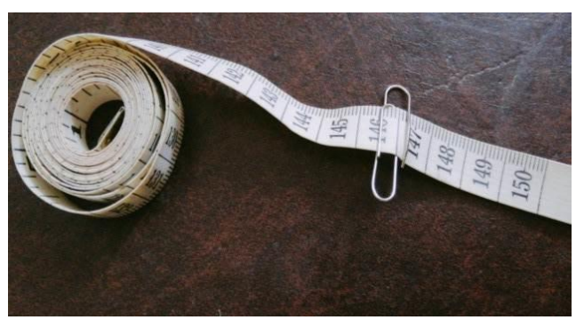
Figure 1. Clinical Tape with a Paper Clip

Screening protocol. Each participant went through an examination for leg length discrepancy and spinal scoliosis. A standard clinical tape with a paper clip was used to the nearest 0.5 mm that was previously reported to have high interrater reliability and good accuracy compared with computed tomographic scanograms (20)(Figure1). Moreover, a scoliometer application combined with the Adams forward bending test was used to detect axial trunk asymmetry (21). This scoliometer application is one of the best applications within the Android and Apple systems used for measuring trunk inclination compared with a manual scoilometer (22). This study used the smartphone "Huawei nova 3i" with the following dimensions: 157.6 mm length, 75.2 mm width, and 7.6 mm thickness. The procedure was repeated twice as described previously (23) (Figure 2).