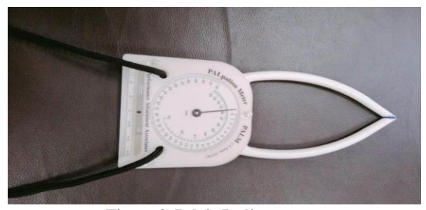
Figure 3. Pelvic Inclinometer

acceptance and compliance and reduce collection and interpretation bias. The patients were asked to rate their perceived sensation of instability on the 10-cm VAS, with 0 indicating no instability and 10 indicating the worst instability. After that, the score was measured, then divided by 10, and multiplied by 100 (24).