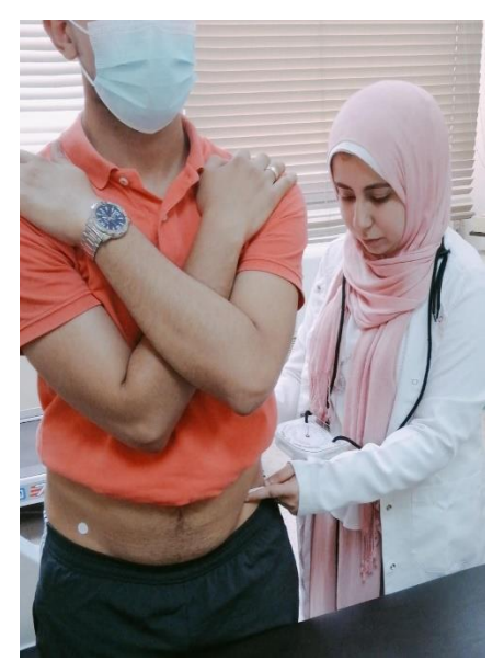
Figure 4. Pelvic Torsion Measurement

The assessor was the same throughout all data collection. To assure the inter-rater reliability, the PT of 20 participants had been measured at two separate times, 1 week apart and with the same setting (25).