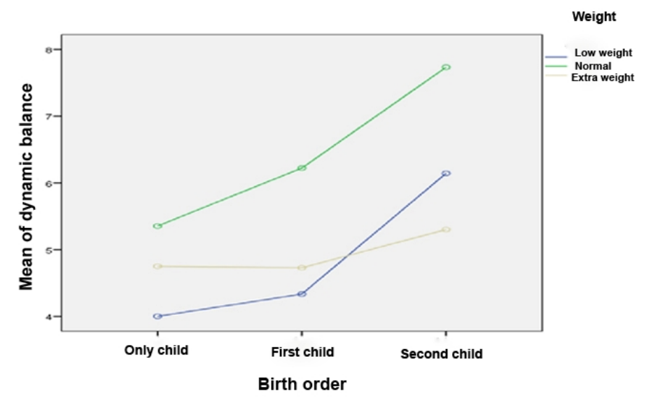
Figure 2. The effect of interaction between birth order and birth weight for dynamic balance